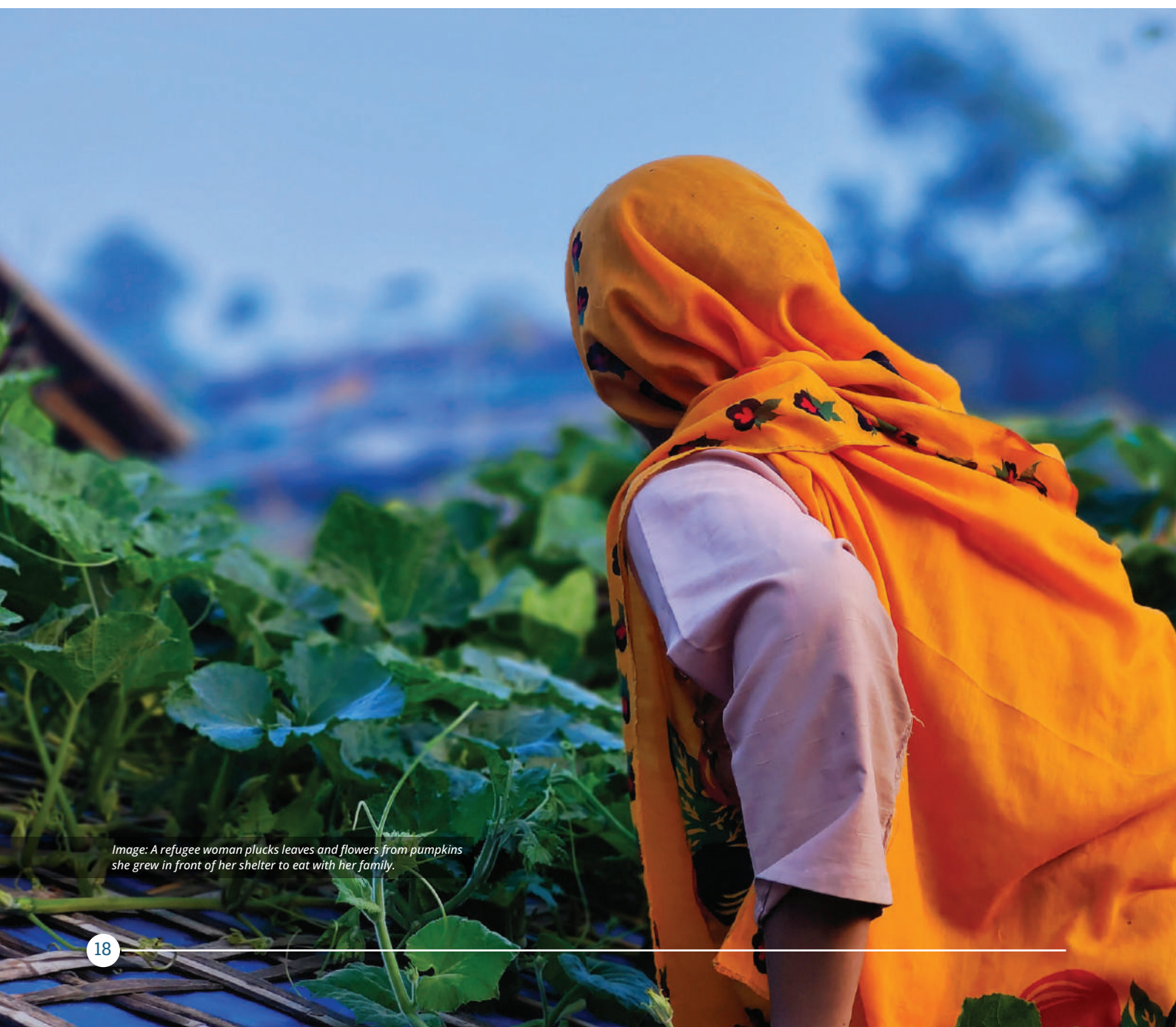
Image: A refugee woman plucks leaves and flowers from pumpkins she grew in front of her shelter to eat with her family.

In relation to women's issues, respondents noted that UN Women had developed relationships with the most prominent leaders of women's RLIs, and they had convened monthly meetings and engaged several women as volunteers who were paid a stipend to conduct community outreach activities. The RLI leaders who were involved in these activities seemed to feel more meaningfully engaged than those who engaged with other agencies. At the same time, there were points of dissatisfaction. Participants indicated that they were not always fairly compensated for their time or input when they engaged. Furthermore, respondents suggested that sometimes meetings felt extractive and that they received little in return for their work, despite providing a steady flow of essential information and insights that the agency needed. One woman felt that after consistent engagement for two years, 'we are becoming less trustful'. While there are restrictions by the Bangladesh government on work and compensation, compensation for time and work is a rights issue. Acknowledgement of the source of information is always important, as is feeding back to those who contributed so that they can see the impact. These are areas in need of improvement for all stakeholders.