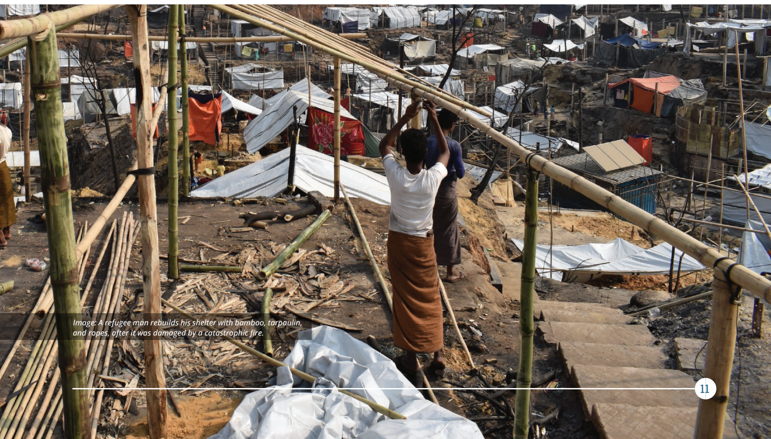
Image: A refugee man rebuilds his shelter with bamboo, tarpaulin, and ropes, after it was damaged by a catastrophic fire.

Camp RLIs are loosely governed due to a lack of resources, paid staff, human resource limitations, and the restrictive environment of the camps. Restrictions can be seen to parallel challenges the Rohingya faced in Myanmar, where they were prohibited from developing a civil society and forming organisations. One group leader said that its members were strictly prohibited from direct involvement in political activities and