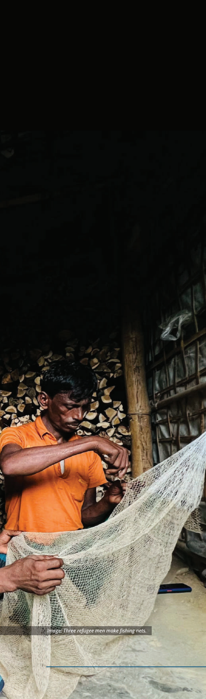
Image: Three refugee men make fishing nets.

Myanmar's civilian National Unity Government (NUG) formed in April 2021 in opposition to the new junta, and its representatives echoed the expressions of solidarity with Rohingya that had already emerged on the streets. Rohingya and the international community appreciated the NUG's tone but called for the appointment of a Rohingya representative to prove that its positive statements were genuine and not mere attempts to garner international support. 11 The NUG eventually appointed a Rohingya civil society leader from Myanmar as an advisor, but to date has not appointed a Rohingya representative. The gap between rhetoric and tangible progress fuelled scepticism among respondents, who pointed out that officials from the National League for Democracy, which held power during the 2017 exodus of Rohingya, are now in senior positions with the NUG. Still, they unanimously saw the NUG as their best hope: