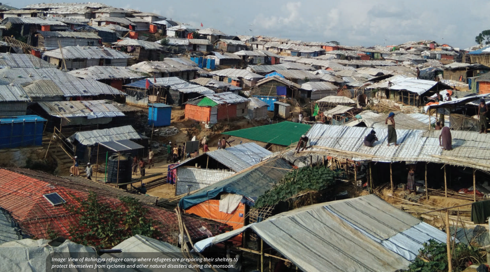
Image: View of Rohingya refugee camp where refugees are preparing their shelters to protect themselves from cyclones and other natural disasters during the monsoon.

The emergence and experiences of refugee-led initiatives (RLIs) in the Rohingya refugee camps of Cox's Bazar are not well documented. Although RLIs have been established in Cox's Bazar to bring attention to community demands and to provide a variety of protection and support services to refugees in the community, too little is known as to how these RLIs engage with their communities and other stakeholders, and what barriers they